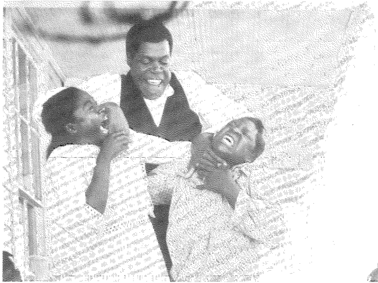
Sisters Nettie and Celie rent apart by Mister in The Color Purple .