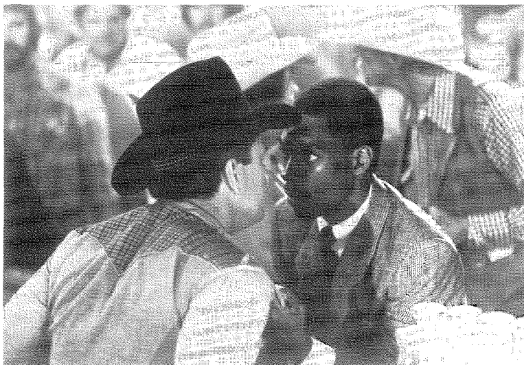
Forty-Eight Hours: Eddy Murphy, as Hammond, getting the facts in the 'red neck' bar.

the black character is only good at subverting order, while the white character restores narrative order – in the end Hammond returns to jail. For the Afro-American audience, however, this racial tension and balance pre-empts any sense of direct 'identification' with Murphy's character because ultimately his 'transgressions' are subject to the same process of discipline and punishment – he is not the hero of the story, although he may be the star of the show. Black protagonists, such as Apollo Creed in Rocky II , receive a similar narrative treatment in which their defeat is necessary to establish the white male character, Rocky, as the hero. In both cases, the Afro-American spectator is denied the possibility of identification with black characters as credible or plausible personalities. Thus, it cannot be assumed that black (male or female) spectators share in the 'pleasures' which such films are able to offer to white audiences.