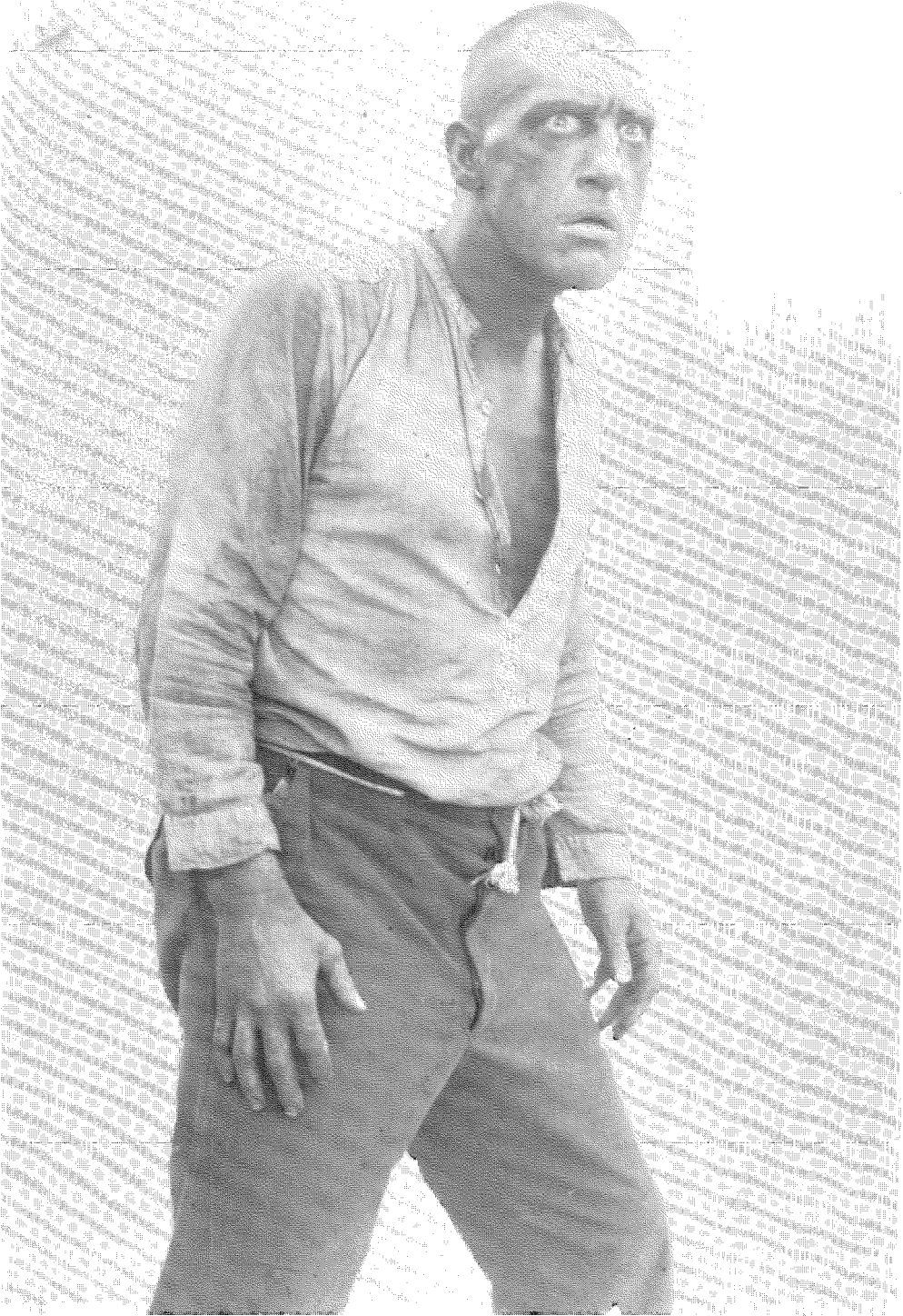
Gus as the embodiment of evil, inferiority and Otherness (played by a blacked-up white actor).